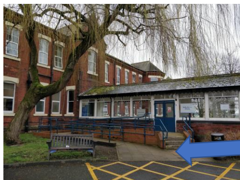
Willow House St Mary's Hospital Armley LS12 3QE