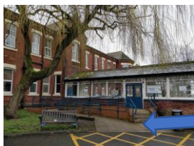
Willow House St Mary's Hospital Armley LS12 3QE