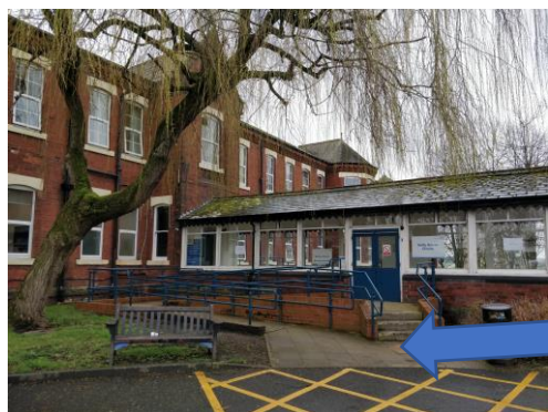
Willow House St Mary's Hospital Armley LS12 3QE